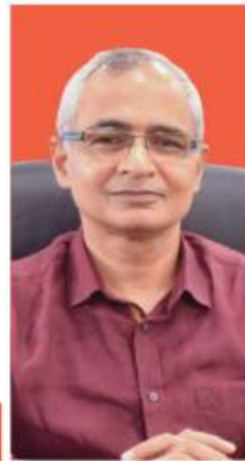
Dr. Neeraj Mittal

Hon'ble Minister of State for communications and Rural Development, Government of India