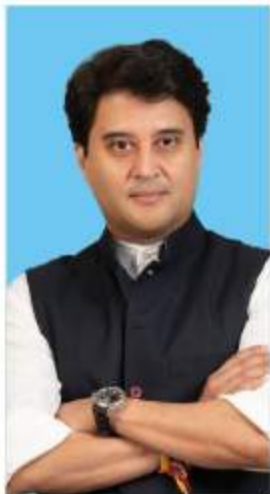
Shri Jyotiraditya M. Scindia

Hon'ble Minister for Communications and Development of North Eastern Region, Government of India