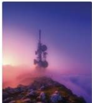
5G & 6G