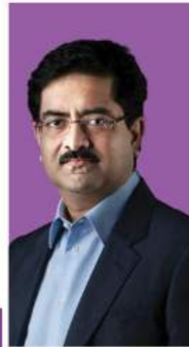
Kumar Mangalam Birla