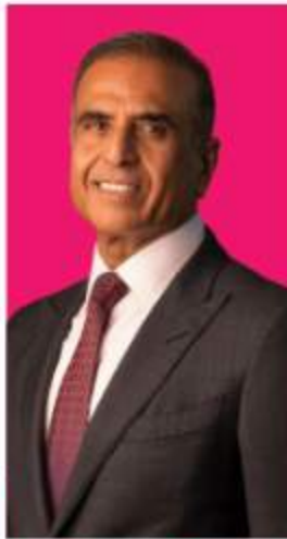
Sunil Bharti Mittal

Chairman, Reliance Jio Infocomm Ltd (RJIL)