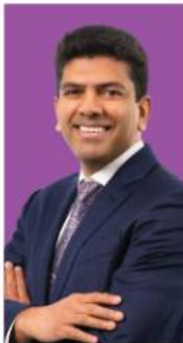
Dr. Pemmasani Chandra Sekhar

Hon'ble Minister for Communications and Development of North Eastern Region, Government of India